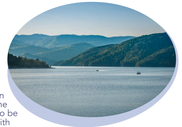
Jocassee Lake Devil's Fork State Park