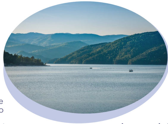
Jocassee Lake Devil's Fork State Park