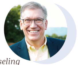
Pastor of Biblical Counseling